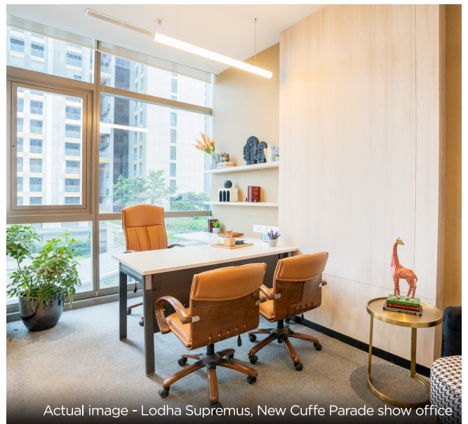
Actual image - Lodha Supremus, New Cuffe Parade show office