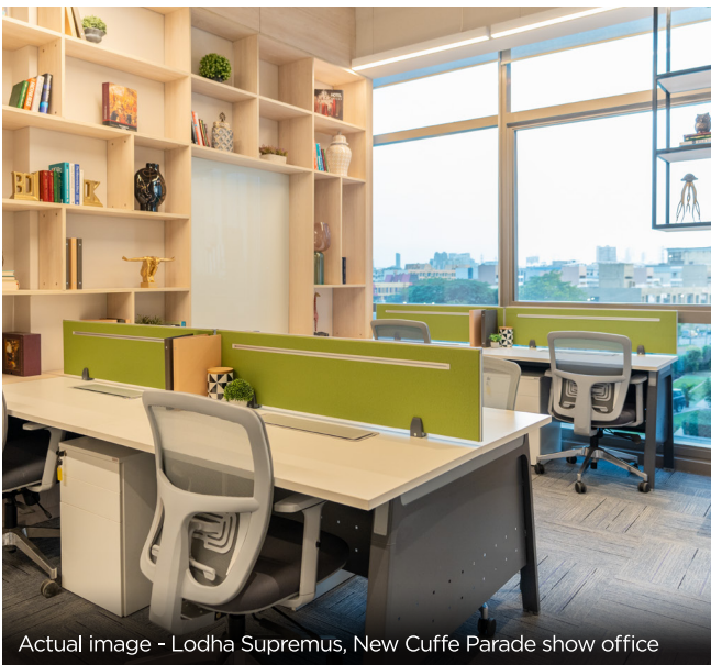
Actual image - Lodha Supremus, New Cuffe Parade show office

Actual image - Lodha Supremus, New Cuffe Parade lobby